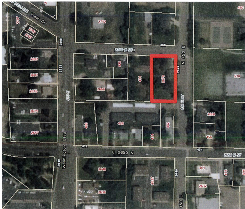
Current Zoning (prior to rezone)

The zoning for parcel 180200012, (as shown outlined in red below), shall be changed so that the entirety of the parcel is zoned with the Multi-Family Residential R-4 zoning designation.